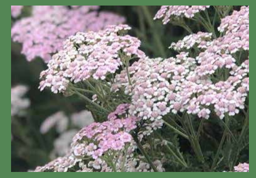
Achillea millefolium 'Summer Pastels'

Most varieties are first year flowering perennials.