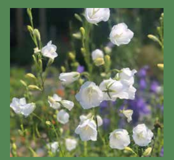
Campanula persicifolia 'Alba'

Bellflower Long slender spikes of large bell shaped flowers.