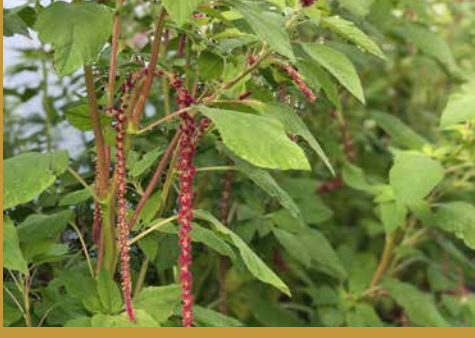
Amaranthus caudatus 'Red' Love Lies Bleeding Long tails of red, good for large arrangements and for drying. Flowers: July-October