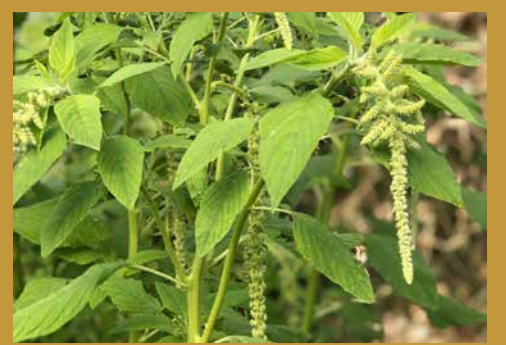
Amaranthus caudatus 'Green' Love Lies Bleeding A stunning version with bright greenyellow tassels. Flowers: July-October