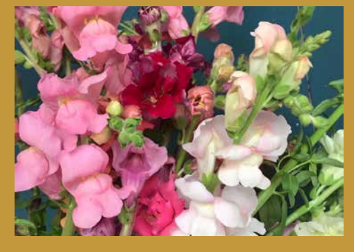
Antirrhinum 'Madame Butterfly Mix' Snapdragon Large, fully double blooms in - pink, red, cream, yellow and salmon.