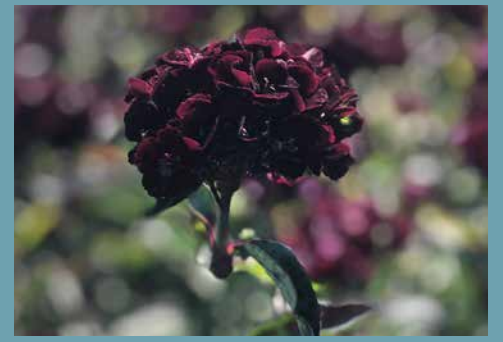
Dianthus barbatus 'Sooty'

These plugs will all be ready from end of July. Most of these varieties can be treated like short lived perennials.