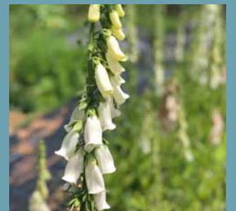
Digitalis purpurea albiflora

CAUTION - ALL PARTS OF THE PLANT ARE TOXIC IF INGESTED.