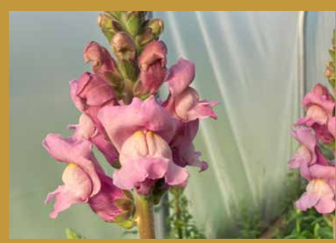
Antirrhinum potomac 'Lavender' Snapdragon Elegant large stylish flowers, strong