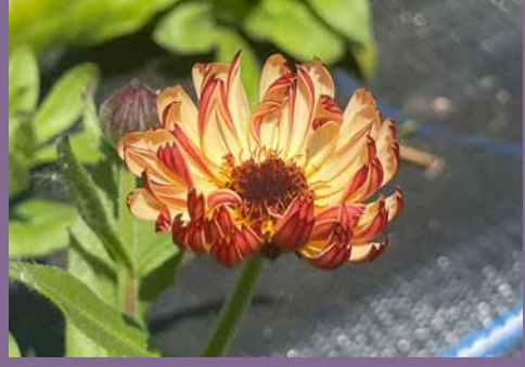
Calendula officinalis 'Coffee Cream'