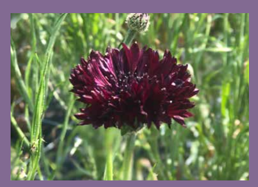
Centaurea cynanus 'Black Ball'