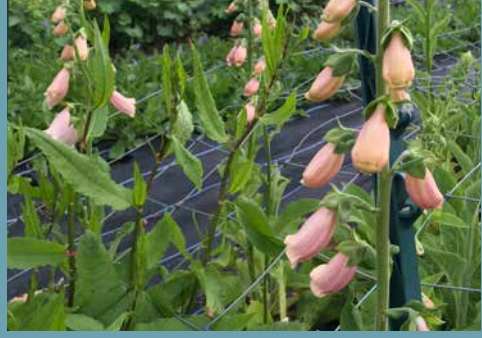
Digitalis purpurea 'Sutton's Apricot'