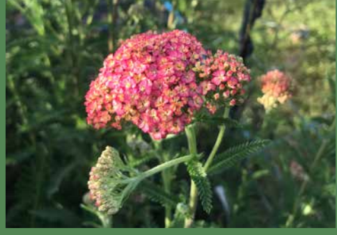
Achillea millefolium 'Summer Berries'