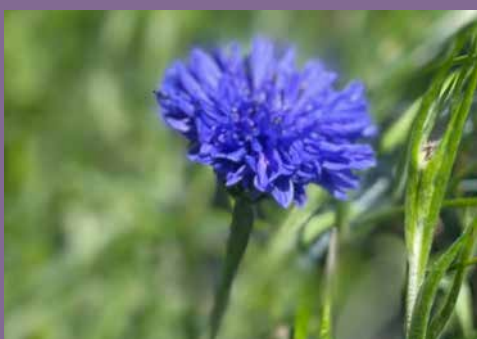
Centaurea cynanus 'Blue Boy'