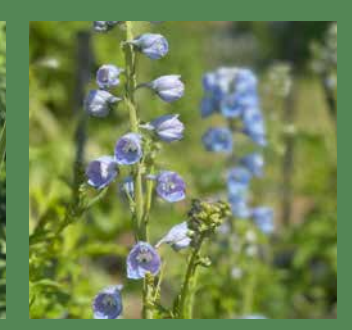
Delphinium elatum 'New Zealand Hybrid Mix'

Strong stems and magnificent large blooms in a wide variety of colours.